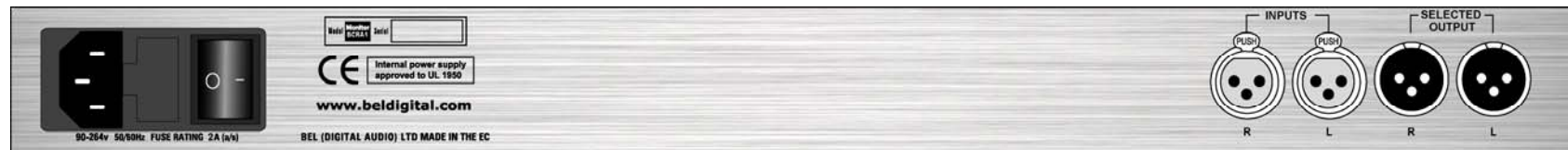
Fig 1.2 BCR-A1 OB Rear panel