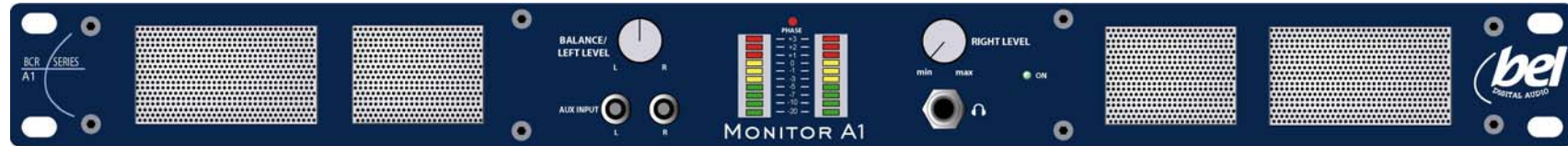
Fig 1.1 BCR-A1 OB Front panel