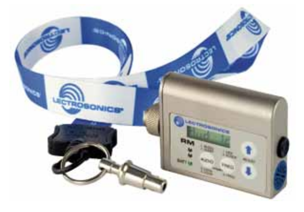
The RM is supplied with a quick-release lanyard

The machined aluminum housing and corrosion-resistant finish protect against damage from rough handling and moisture. A membrane switch panel helps protect the LCD and internal circuits from moisture and dust.